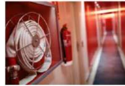
Fire Fighting & System