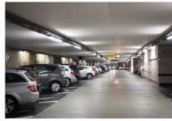
Adequate Parking Spaces