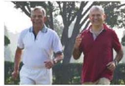
Senior Citizen Corner