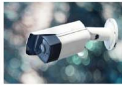
CCTV for Security