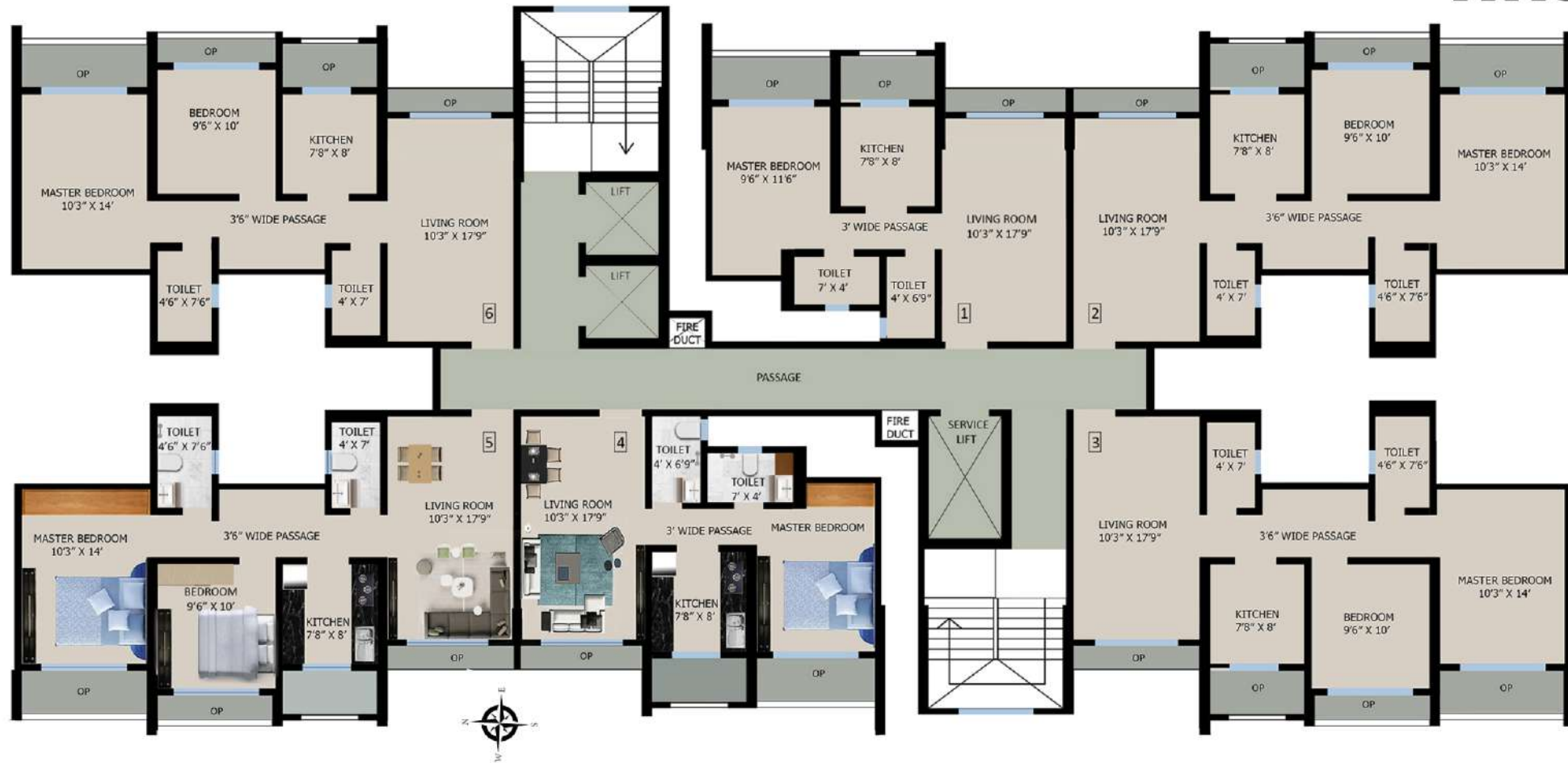
A - WING